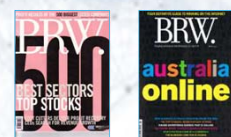
Steven Smith featured in articles in these magazines