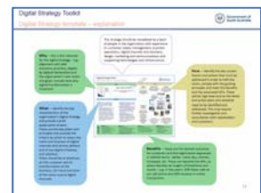
Developed the Digital Strategy Toolkit for the SA Government