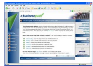
e-businessguide.gov.au Wrote and developed this online guide to Australian SMEs explaining how to do business online